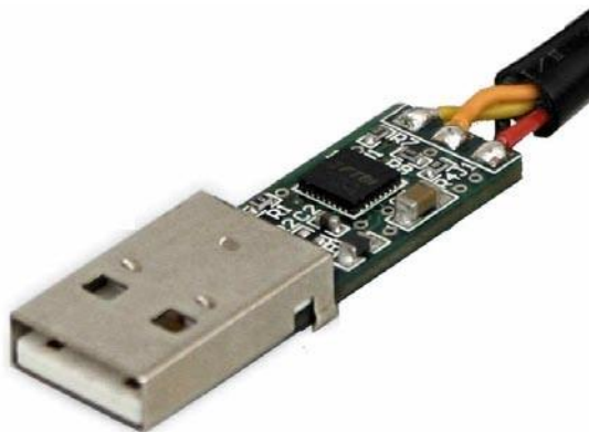
Figure 2 - Inside the USB 'A' connector on the TTL-232R-3V3.