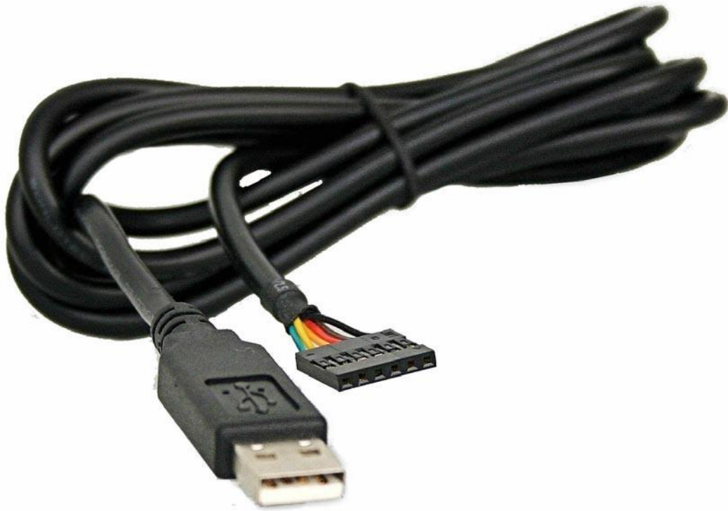
Figure 1 - The TTL-232R-3V3 USB to TTL Serial Converter Cable.